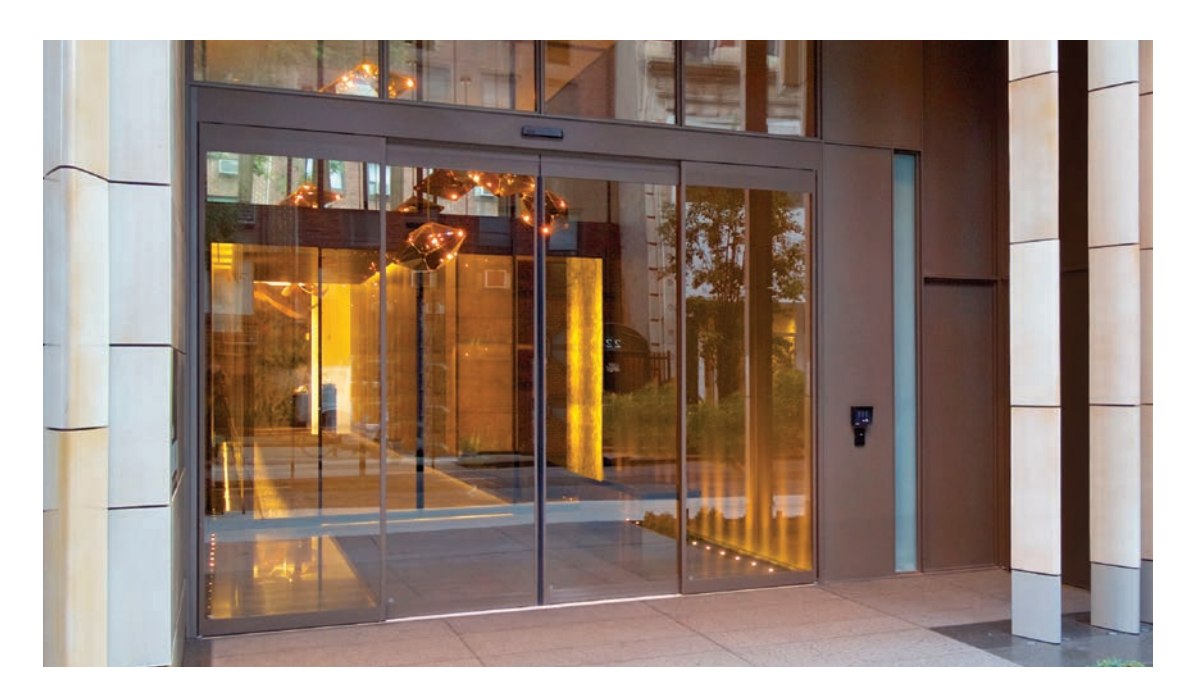
ESA400 Fine Frame 1 Madison Avenue – New York, NY