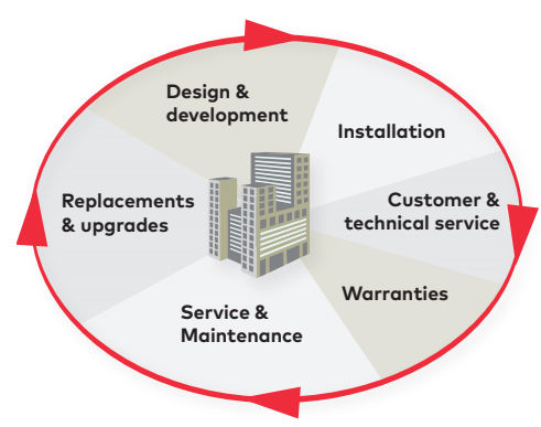
At dormakaba, customer service comes full circle.

From the moment you open your doors, we are your partner for the life of your entrance. To ensure our systems perform at the highest level, we make it our job to provide incomparable customer service, which includes: design consultation, specification writing, installation, replacement and upgrades, maintenance, and technical support—all backed by an extensive warranty you can trust.