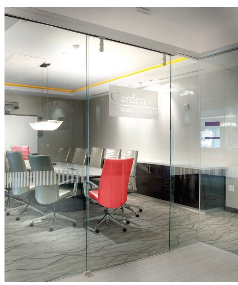
Garden Communities – San Diego, CA