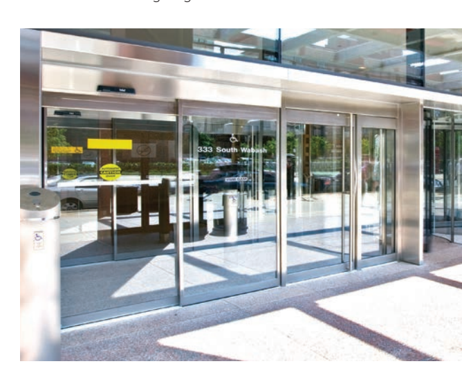
The already stylish ESA400 Fine Frame and ESA500 All Glass doors make elegant entrances when clad in a dormakaba ornamental architectural finish. (Brushed stainless steel cladding shown above.)