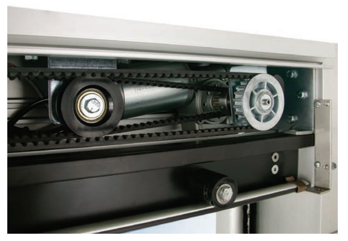
The ESA-T utilizes the proven ESA drive unit with an ultra rigid extrusion and a reliable belt-driven design that features a removeable outer track.

Two breakout designs. The ESA200/500-T doors feature partial breakout of the sliding panels only, while the ESA300/400-T doors feature full breakout of all panels. Both breakout designs are completely engineered, manufactured, and assembled by dormakaba.