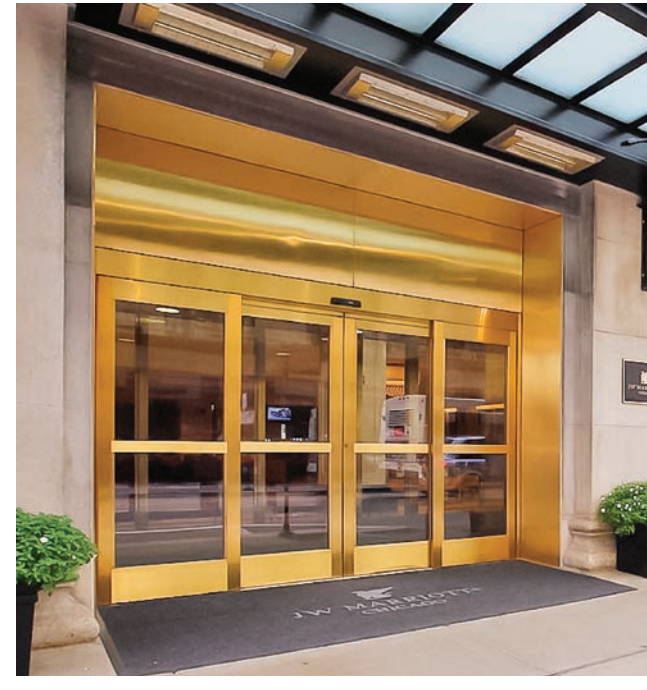
ESA300 with clad bronze finish JW Marriott Chicago – Chicago, IL Architect: Lucien Lagrange & Assoc.

We couple modern technology with old world craftsmanship to manufacture the finest architectural finishes of any manufacturer.