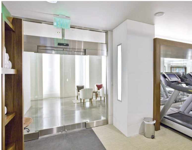
MGM Grand Casino Hotel - Detroit, MI