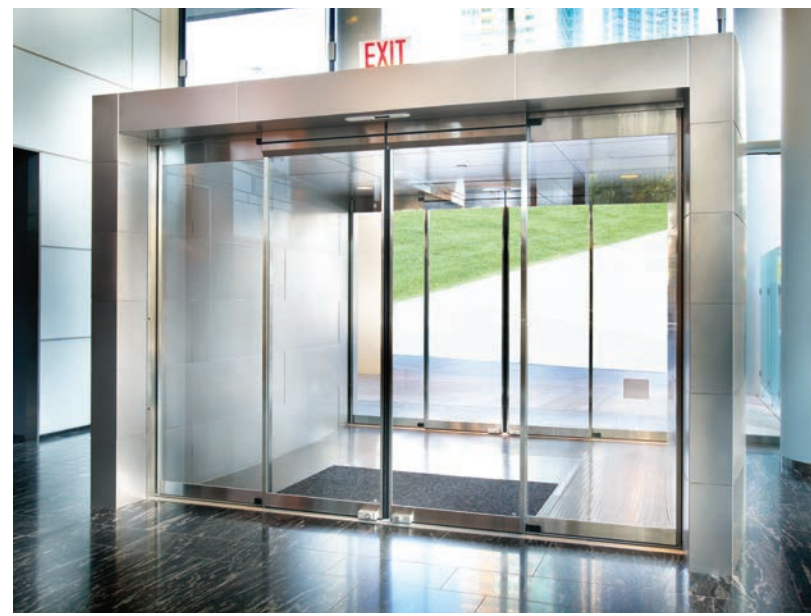
ESA400 Fine Frame exterior (top) and interior (above) Related Companies Luxury Apartments 500 Lake Shore Drive – Chicago, IL Architect: Solomon Cordwell Buenz