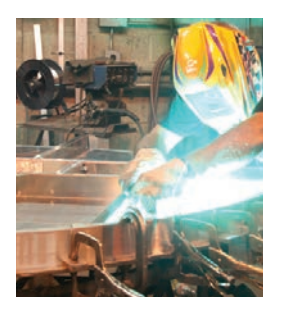
Cladded sliders in stainless steel and bronze are custom fabricated by the same craftsmen who apply ornamental metal finishes to dormakaba's Crane Revolving Doors.

Unparalled choice of finishes. ESA doors can be customized to match virtually any design because dormakaba offers such an extensive range of finishes: wet paint, powder coat, special anodized, and clad finishes—in stock, standard, and custom colors. The base package standard finish is Clear or Dark Bronze Anodized.