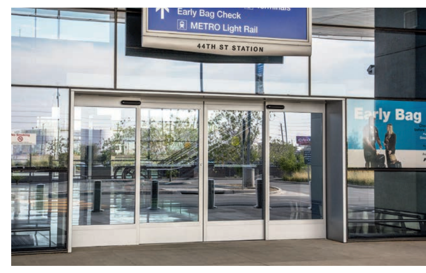
ESA300 PHX Sky Train - Phoenix, AZ Architect: HOK