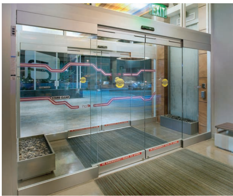
Aloft Detroit at The David Whitney – Detroit, MI Architect: Kraemer Design Group PLC