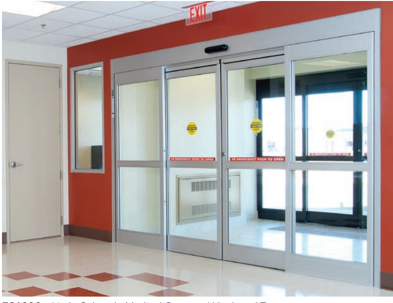
ESA200 Little Colorado Medical Center – Winslow, AZ Architect: Mittelstaedt, Cooper & Associates

Aesthetically superior. dormakaba ESA doors couple rugged door panel construction with a smart design. Our uniform glass stops are designed to maintain consistent sightlines and daylight openings from door panel to door panel. This ensures that sliders using different glass within a vestibule will maintain the same daylight openings.