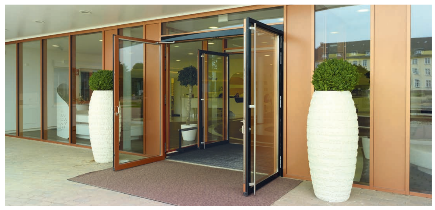
ED100 low energy operator

dormakaba defines security, sustainability and reliability. For more than 150 years, our brands have been associated with trust earned through superior performance and living up to our mission—to make access in life smart and secure. Holding true to this promise and to our values will help us achieve our ambition to be the trusted industry leader.