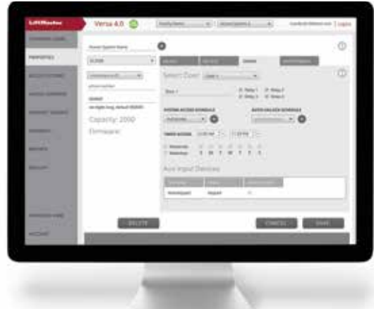
Versa XS 4.0 Software